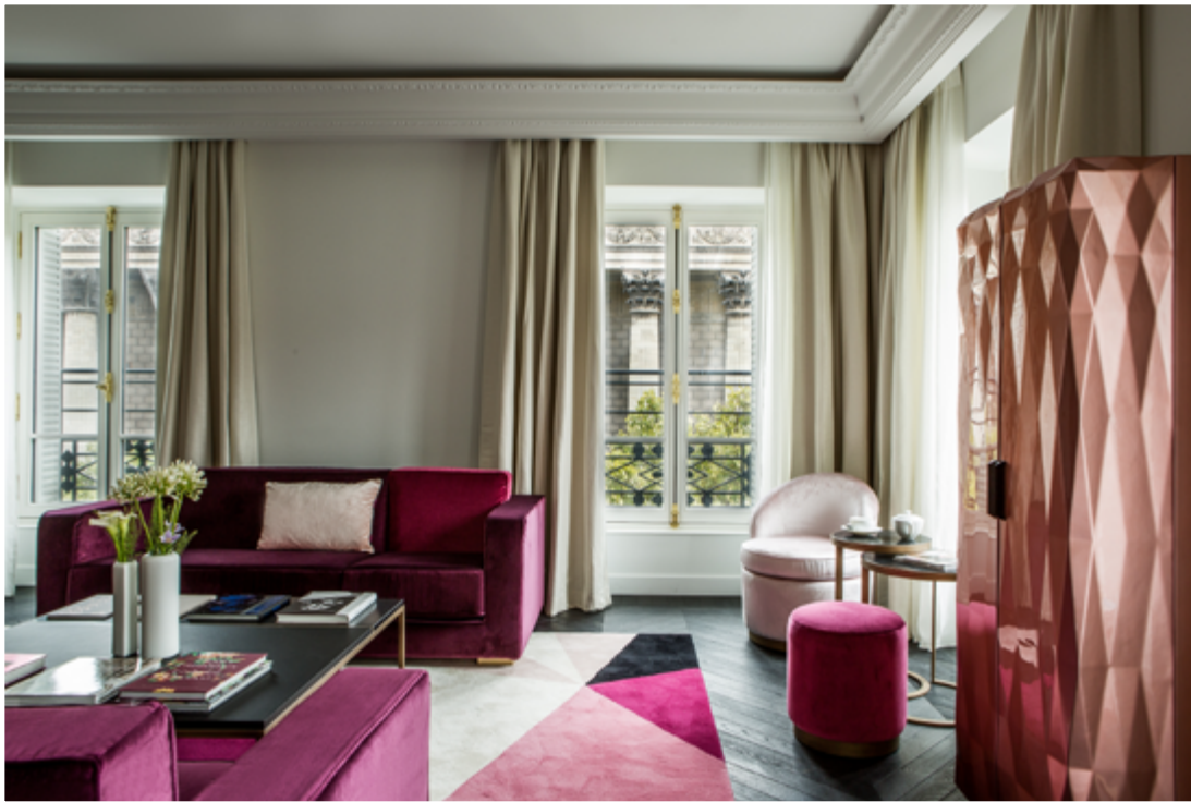
Fauchon Prestige Suite ▲