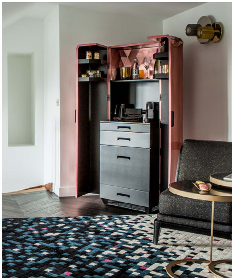
The Gourmet Bar

FAUCHON L'Hotel Paris has disrupted the hospitality industry by reimagining the typical in-room "mini bar." The epitome of the hotel's commitment to creating a centerpiece of gastronomy, the Gourmet Bar is a custom pink armoire designed by Sacha Lakic and produced by the House Roche-Bobois. As attractive as it is functional, this stunning piece of furniture (also available for guest purchase worldwide) enables incomparable gratification. Within the many doors and drawers, guests can enjoy unique moments of pure decadence as they seek and savor favorite FAUCHON delicacies. As our special gift, FAUCHON offers complimentary FAUCHON creations upon arrival to suit your taste preferences. We will customize the contents according to your preference: salty, sweet, or tasting (a combination of both). The Gourmet Bar includes a "fresh product" cabinet for pastry, chocolates, and foie gras, as well as a preview of other FAUCHON specialties all kept at the ideal temperature. The "drinks" cabinet is the perfect spot to hold wine, spirits, champagne, water, juices, and soft drinks. As well as an area to enclose the hot water kettle and Nespresso coffee machine for FAUCHON tea, and coffee. The FAUCHON items in the Gourmet Bar are complimentary and guests are invited to take any unused items home to share with friends and family or as a reminder of their stay. Behind a small partition there are soft drinks, beer, and wine, which are available for a fee.