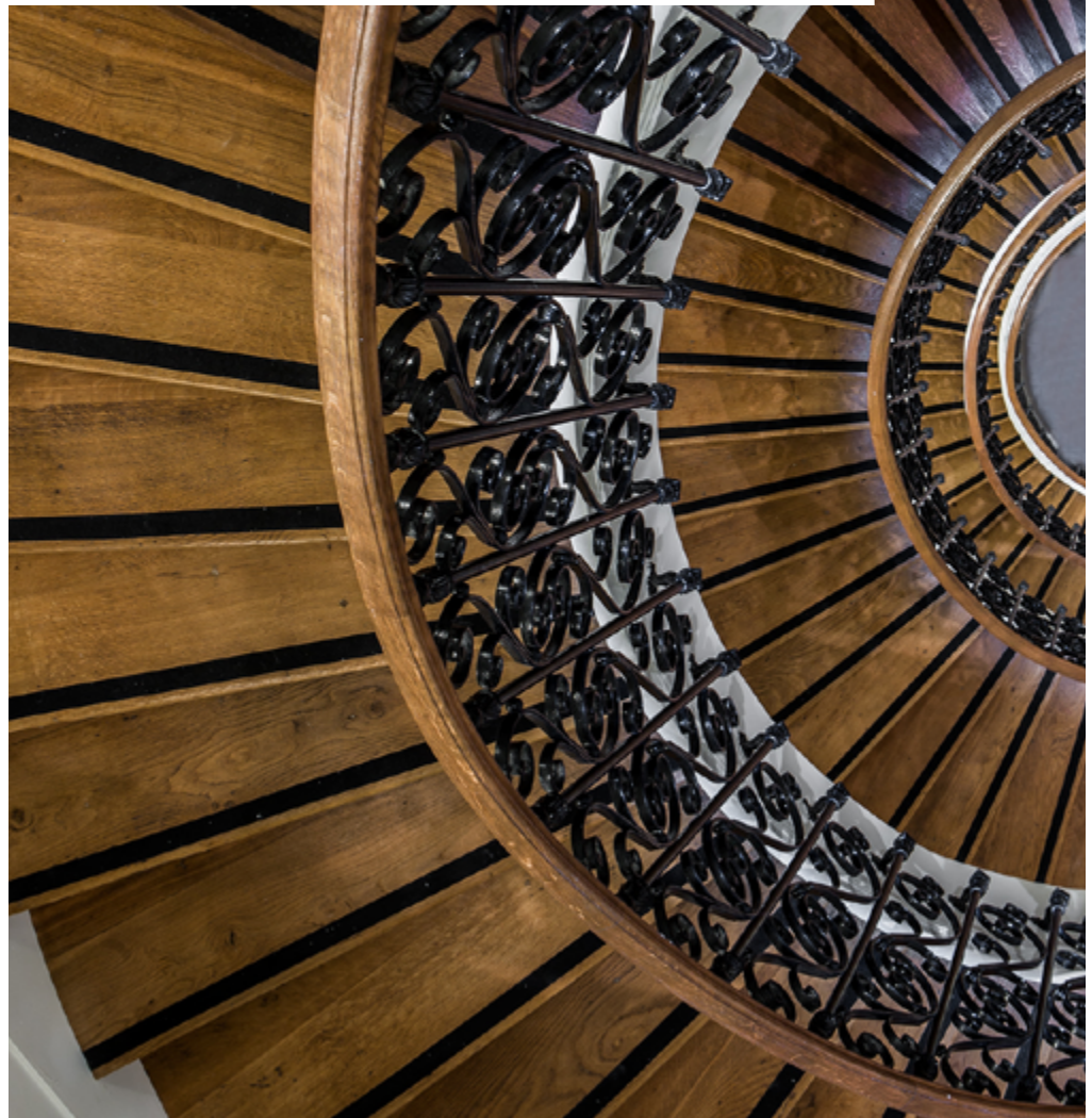
Historical staircase ►