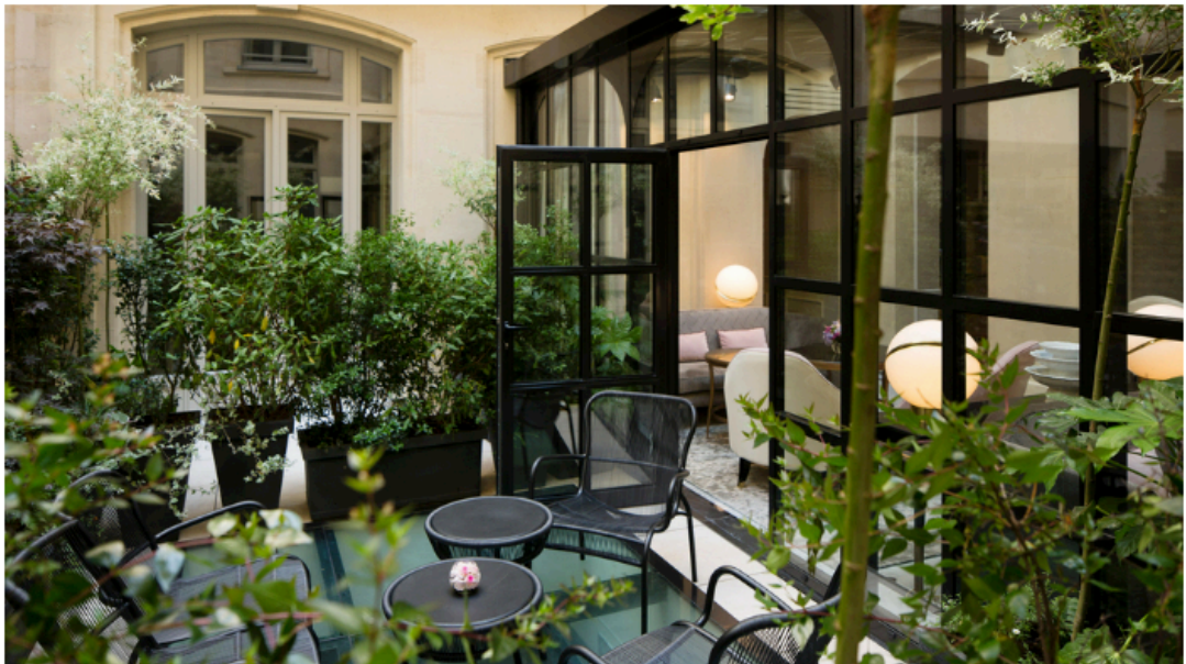
The verdant hotel terrace

My room featured majestic high ceilings and an expansive terrace with a breathtaking view of the City of Lights. One of the master suites even offers a fireplace — both dreamy and functional for the winter season. All rooms shine with fine details of gold foil, tastefully applied, accentuated by white floral fixtures staying true to the name, Le Narcisse Blanc.