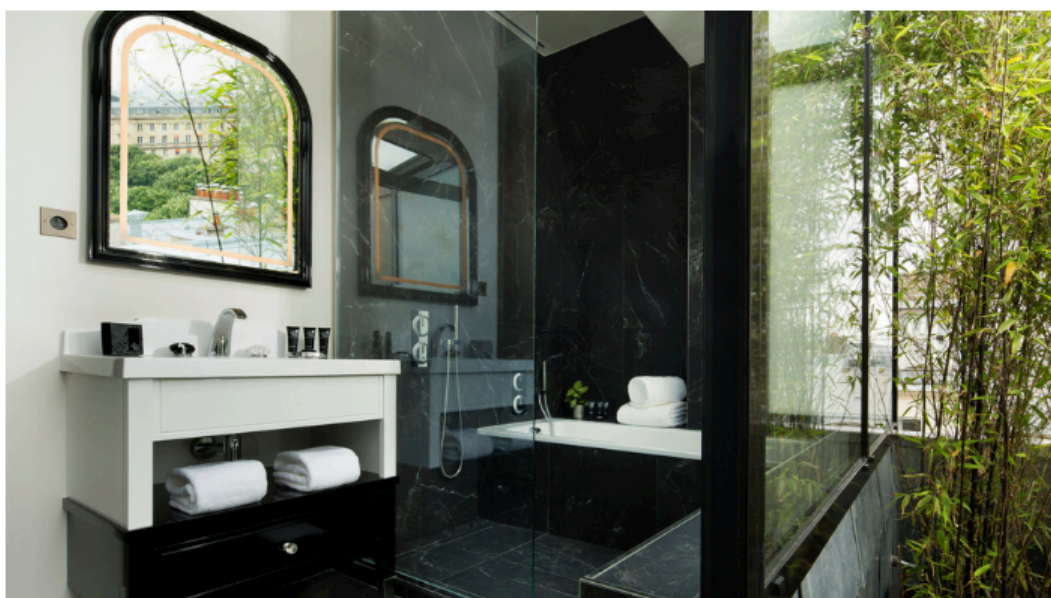
An interior view of the bathroom replete with marble

Guests must make sure to enjoy the culinary expertise of Chef Zacchary Gaviller. One evening I thoroughly relished the squid ink infused pasta, encompassing a fiery kick—a taste greatly missed in midst of the Dubai summer heat. After days filled with meetings, I relaxed in the courtyard garden and rejuvenated at the expansive spa, featuring a pool, hydrotherapy massage jets, a sauna, hammam, a fitness centre as well as a range of spa treatments by luxury skincare brand Carita.