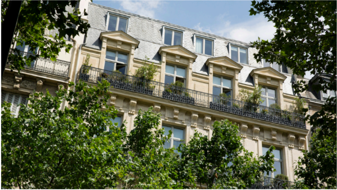
An exterior view of Le Narcisse Blanc Hotel

My room featured majestic high ceilings and an expansive terrace with a breathtaking view of the City of Lights. One of the master suites even offers a fireplace — both dreamy and functional for the winter season. All rooms shine with fine details of gold foil, tastefully applied, accentuated by white floral fixtures staying true to the name, Le Narcisse Blanc.