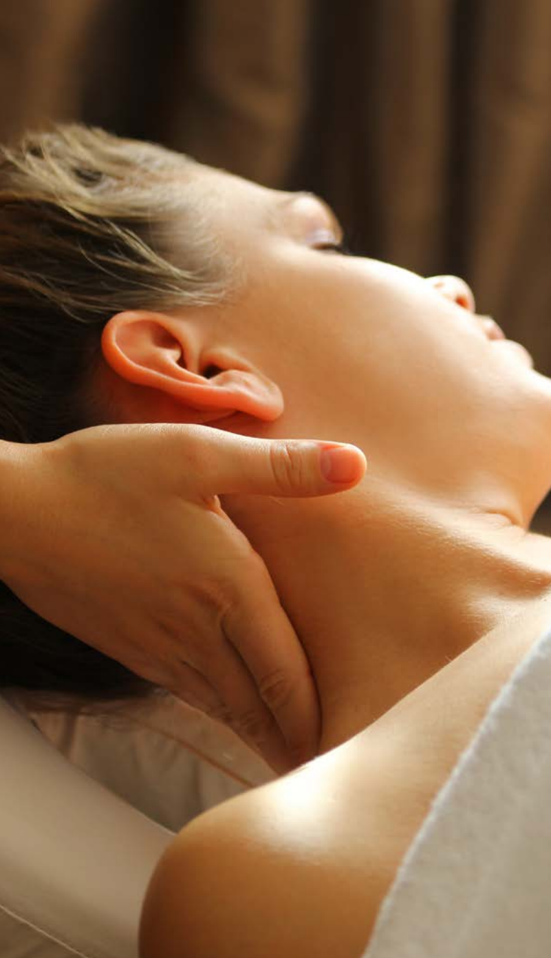
MASSAGES AND TREATMENTS