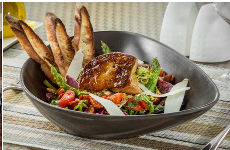
Les Caroubiers restaurant and lounge bar within The Clubhouse