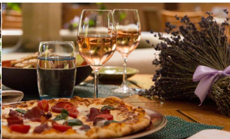
Le Tousco located adjacent to the infinity pool