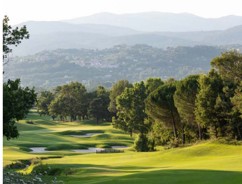
LE RIOU COURSE AND THE CLUBHOUSE