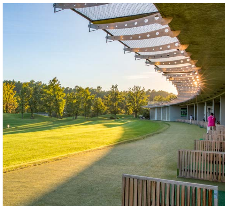
THE ALBATROS GOLF PERFORMANCE CENTER