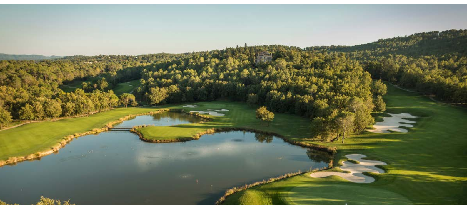
LE CHATEAU COURSE