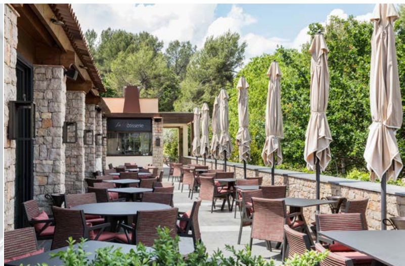
Le Gaudina restaurant and lounge bar