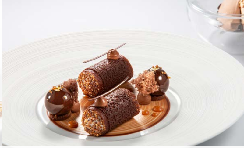
Le Faventia , contemporary French gastronomy restaurant