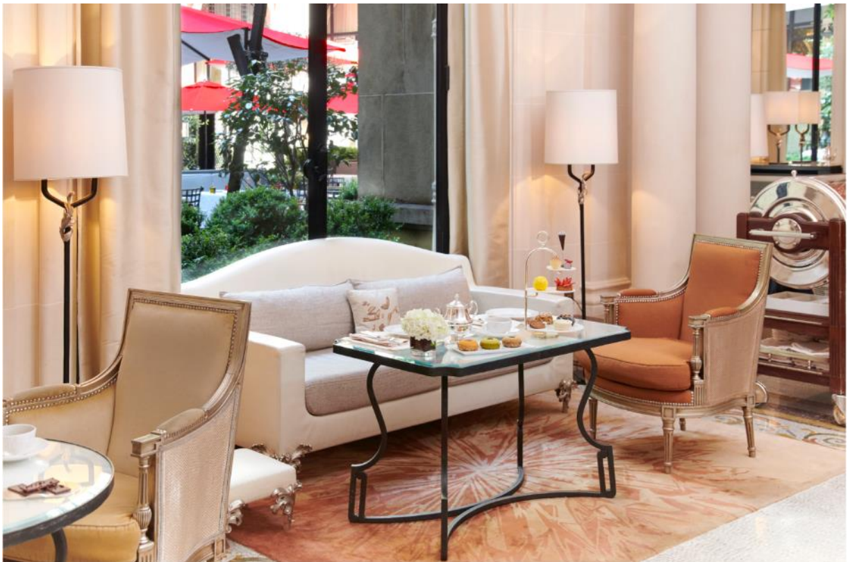
La Galerie