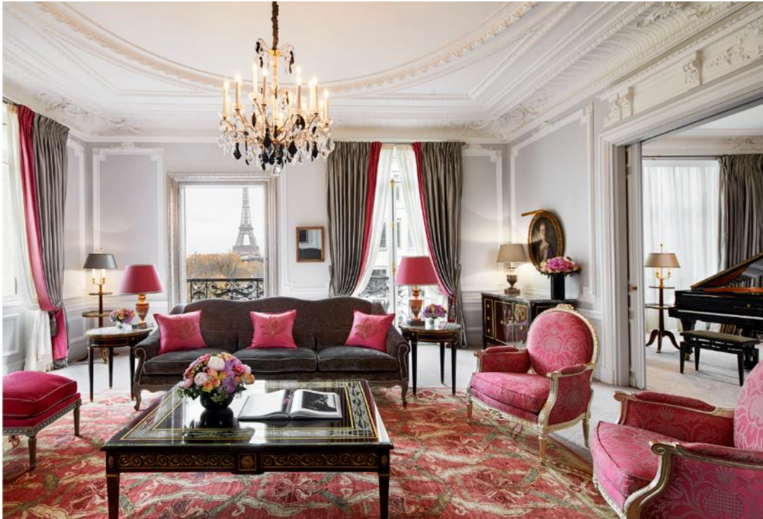
Suite Eiffel Signature

The history of Haute Couture speaks of its passions in the charming design of this silken suite. Just like a couture dress, the symphony of soft grey and pinks, the elaborate moldings, which accentuate wonderful high ceilings, the rich couture-house fabrics and the cushions re-embroidered by the famous maison Lesage confer a unique style and a timeless elegance to the suite. The stunning view on the Eiffel Tower seems unreal, a piece of art in an ornate frame.