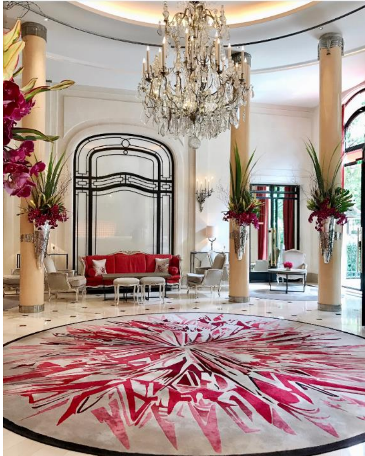
The lobby

When entering the lobby, guests will be instantly immersed by Haute Couture. Floral displays add to the welcoming atmosphere and are changed every week. Bronze, marble and brushed oak furnishings have been designed, along with wood paneling on the walls. The beautifully designed mosaic floor is adorned with a rug inspired by a crystalline motif, which echoes the large chandelier.