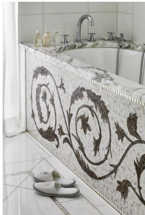
Suite Eiffel Signature