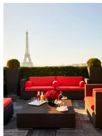
Suite Eiffel Signature Terrasse