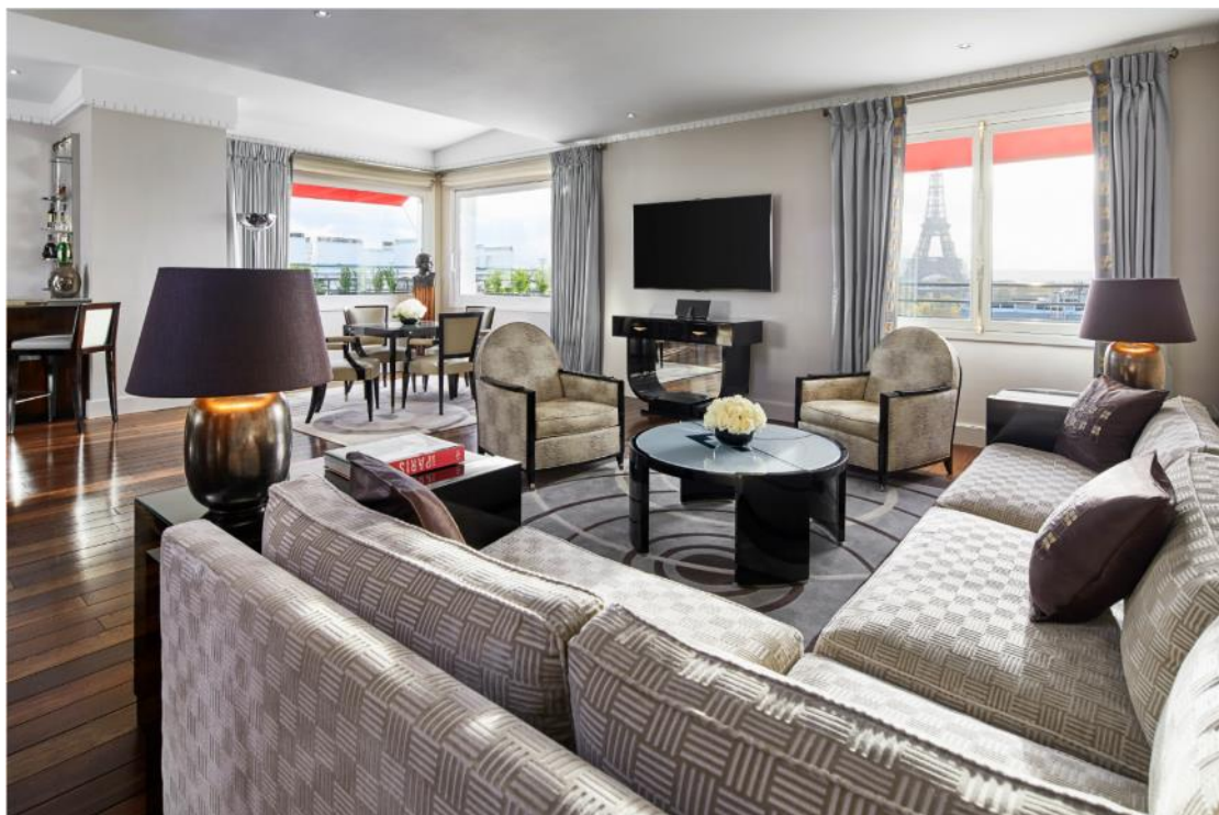
Suite Eiffel Signature

Two styles, one iconic view. In this second signature apartment in Art Deco style, the iron lady can be admired from the bedroom to the living place through the bathroom and the private terrace. This Art Deco inspired masterpiece features sleek rosewood, Macassar ebony and mahogany woodwork, heavy silk curtains in silver grey tones and textiles by Pierre Frey, a tribute to artisan craftsmanship.