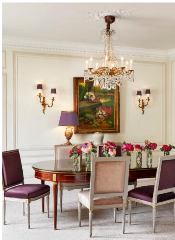
Suite Royal