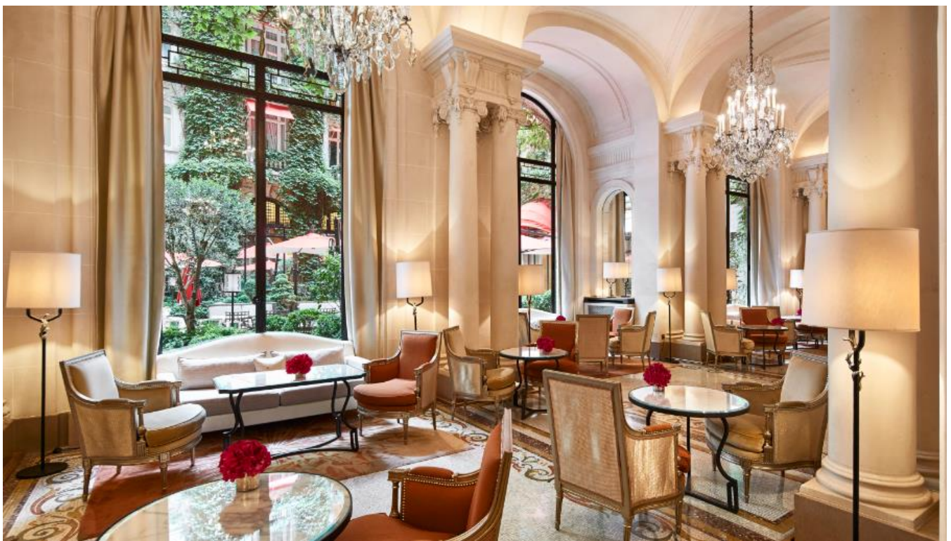
La Galerie

Internationally acclaimed interior designer Bruno Moinard designed the lobby, La Galerie, La Cour Jardin, the Salon Organza and the ballroom named the Salon Haute Couture. In order to create a spectacular yet discreet atmosphere, without changing the Hotel's concept, Bruno Moinard has placed emphasis on a subtle silver color scheme complementing the existing features of the Hotel highlighted by light effects, be they natural or electric.