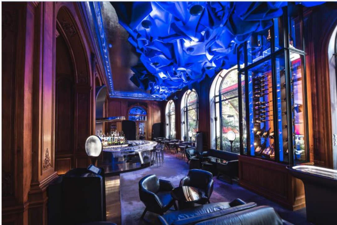
Le Bar du Plaza Athénée

Since October 2018 the bar will be featuring an exclusive collection of truly exceptional Dom Pérignon white and rosé champagne, including Vintage, P2, P3 and Magnum, Jeroboam, Mathusalem. This unique selection, which cannot be found anywhere else in the world, can be savoured onsite or added to a fine wine collector's private cellar.