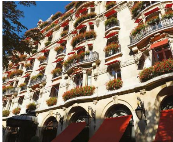
Façade du Plaza Athénée

"Our establishment has a close relationship with the couture houses on Avenue Montaigne, not only through the bespoke services that we offer each of our guests, but also because we are closely connected to our employees, who may well be working behind the scenes but who are very much in the spotlight in keeping the Hotel running – similar to the seamstresses who work behind the scenes of a fashion show."