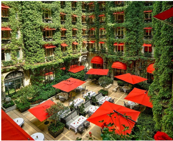
La Cour Jardin

In winter, the courtyard is covered in ice to create a rink of almost 100 square meters! With a dedicated instructor at hand, the ice rink gives children a safe place to skate while their parents can look on from the indoor comfort of the Galerie.