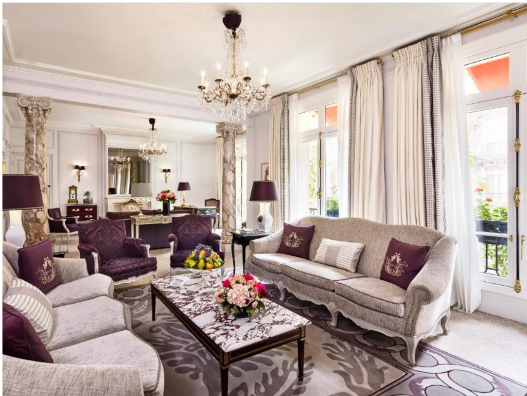
Presidential Suite

208 rooms and suites, all with a unique style, are designed as private apartments. The first six floors indulge in a classical Haussmanien universe with authentic furnitures and high ceilings whereas the seventh – recently redesigned by the agency Moinard and Bétaille - and eighth floor in Art Deco style pay tribute to geometrics. Fifty-two rooms offer a stunning view on the elegant avenue Montaigne.