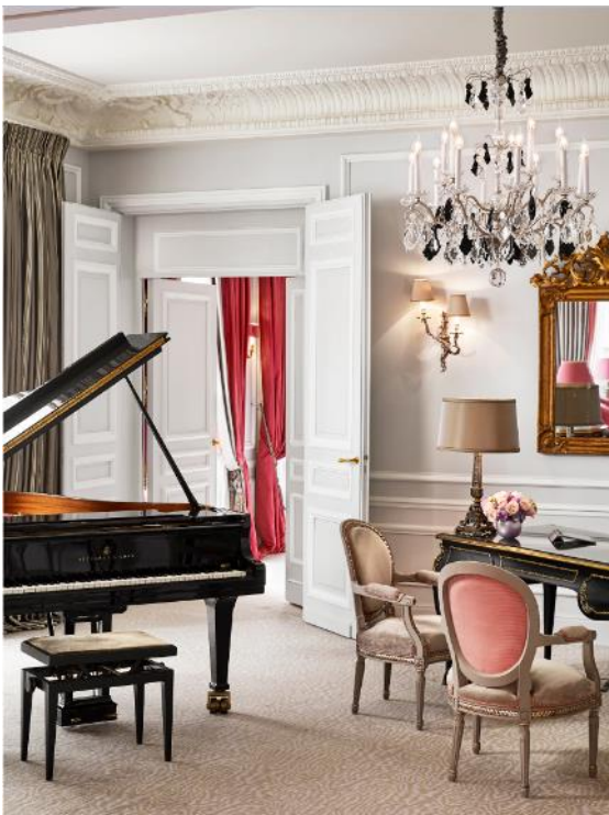
Suite Eiffel Signature