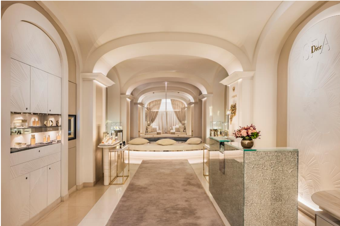
Reception

Since it was founded in 1946, Dior has maintained a strong relationship with the Hotel Plaza Athénée. Christian Dior was passionate about the Hotel which resulted in the opening of the Dior Spa in 2008. Exuding a modern and elegant atmosphere, Dior Spa is composed of five treatment rooms including one double, and takes on Dior's Haute Couture spirit on 30 avenue Montaigne to provide guests with a high quality and bespoke service.