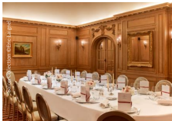
SALON COLLECTION : 55m 2 /5382ft 2

The whole spirit of Haute Couture is celebrated through light in the Salon Organza. In the center of the room, a rug is printed with a pattern that matches La Galerie's wing chairs and the sofas in La Cour Jardin. The 85 square meter room can accommodate up to 120 guests.