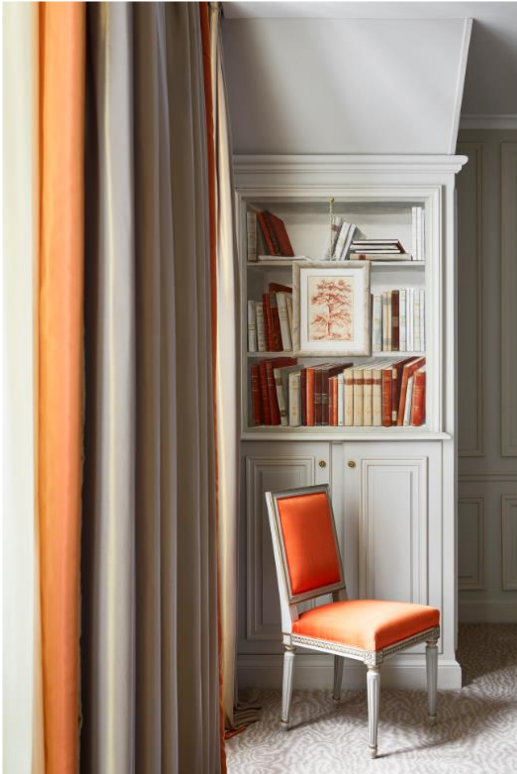
Superior Suite