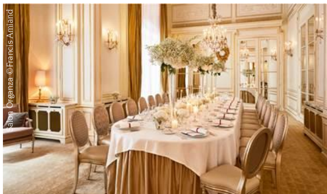
SALON ORGANZA : 85m 2 /915ft 2

Hotel Plaza Athénée offers versatile spaces to host a variety of events, from corporate meetings to grand social occasions: a spacious ballroom (Salon Haute Couture), a warm space for "breaks", (Salon Organza) along with two adjoining meeting rooms (Création rooms A & B) located on the upper floors of the Hotel.