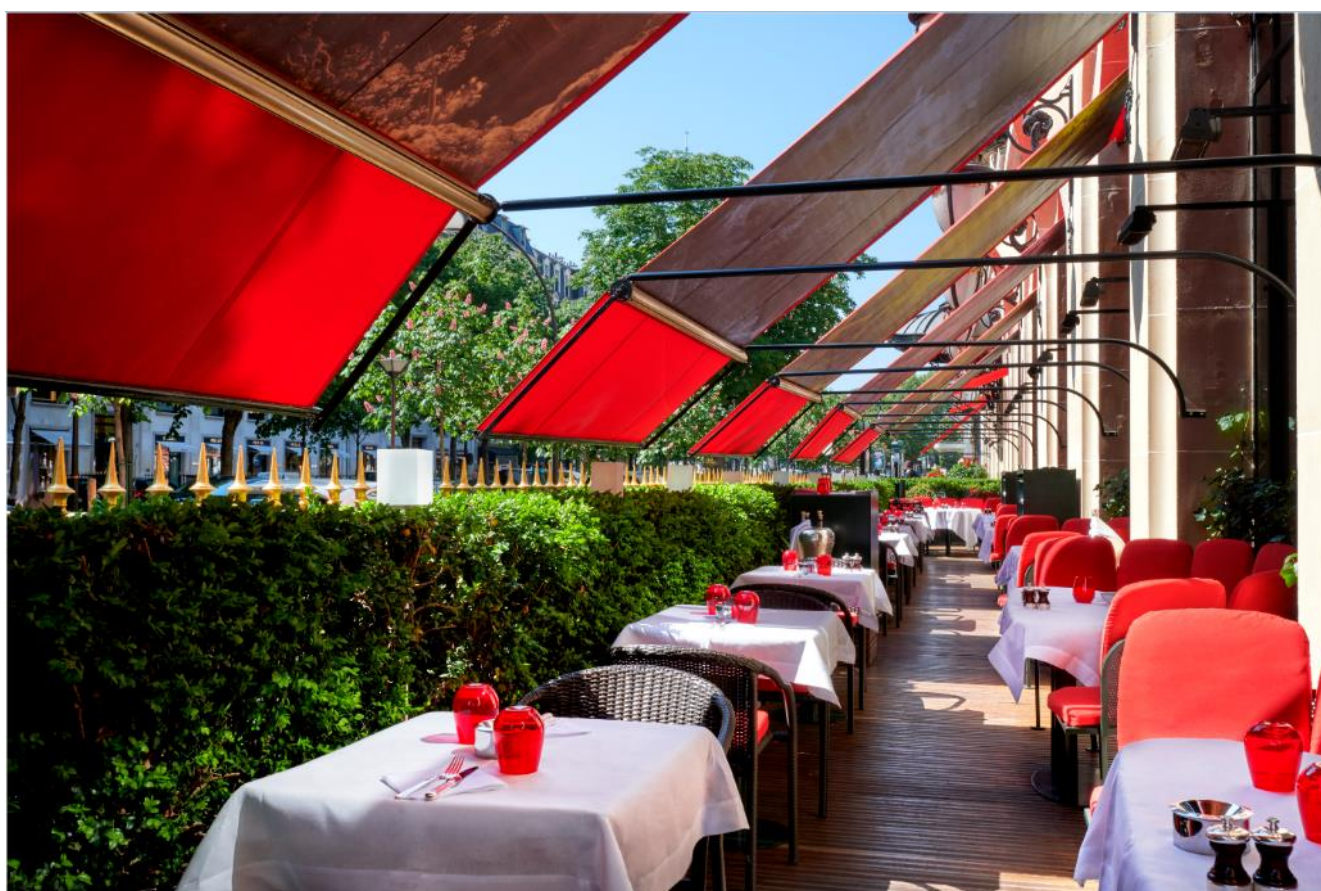
La terrasse Montaigne

Located on the most elegant street of Paris, the Terrasse Montaigne runs along the façade of the hotel, creating a natural spotlight of attention. Open during spring and summer, it is the perfect place for a shopping pause or an evening cocktail