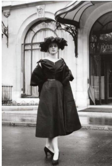
Facade of the Plaza Athénée Christian Dior model in front of the Plaza Athénée