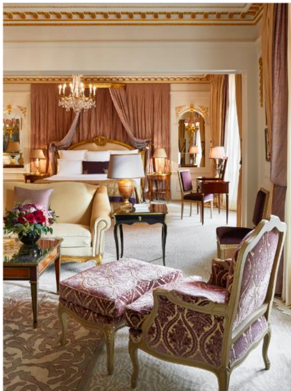
Junior Suite Prestige