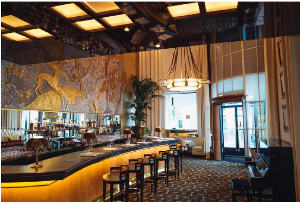
Le Relais Plaza

For this project, the chef wanted to offer a cuisine driven by values that are dear to him, inspired by his grandmother, with iconic dishes but also many new products from Parisian brasserie cuisine.