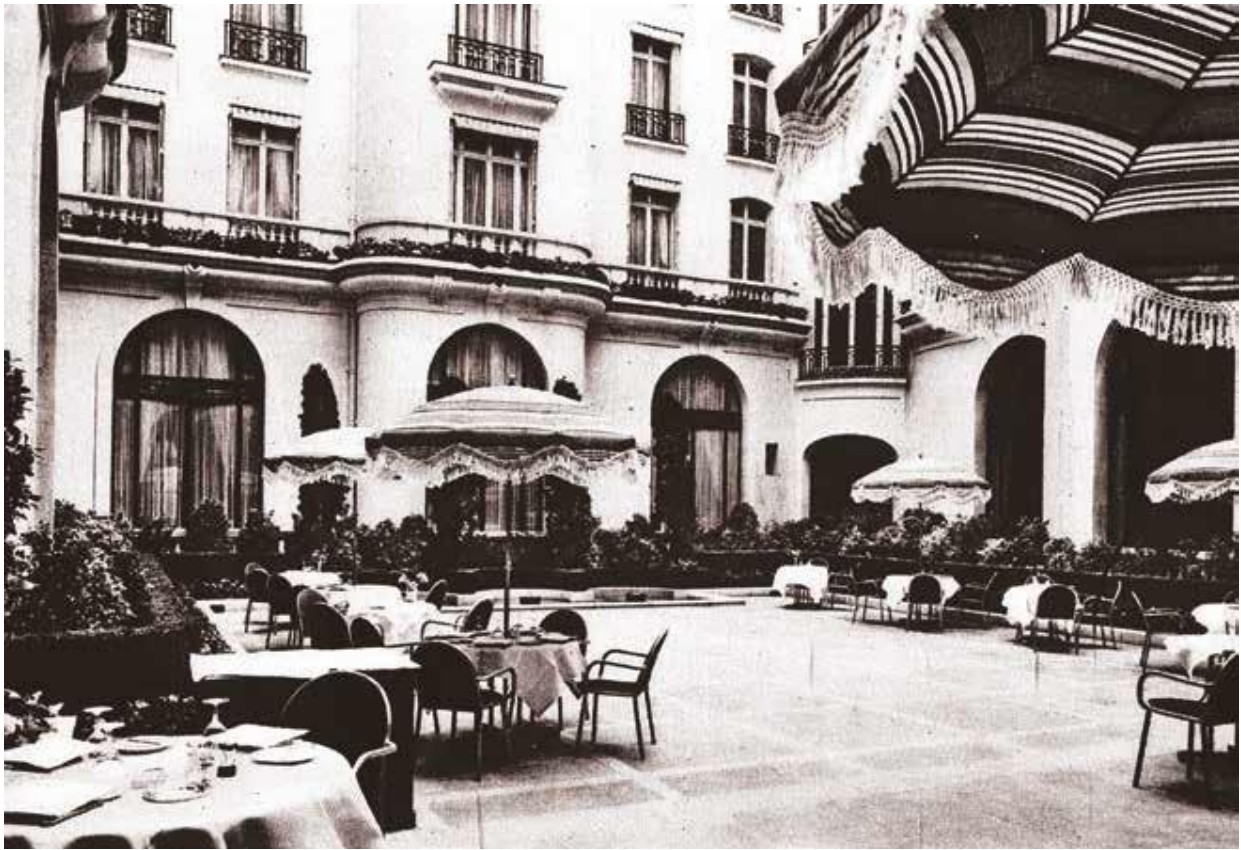
Cour Jardin in the 1960's