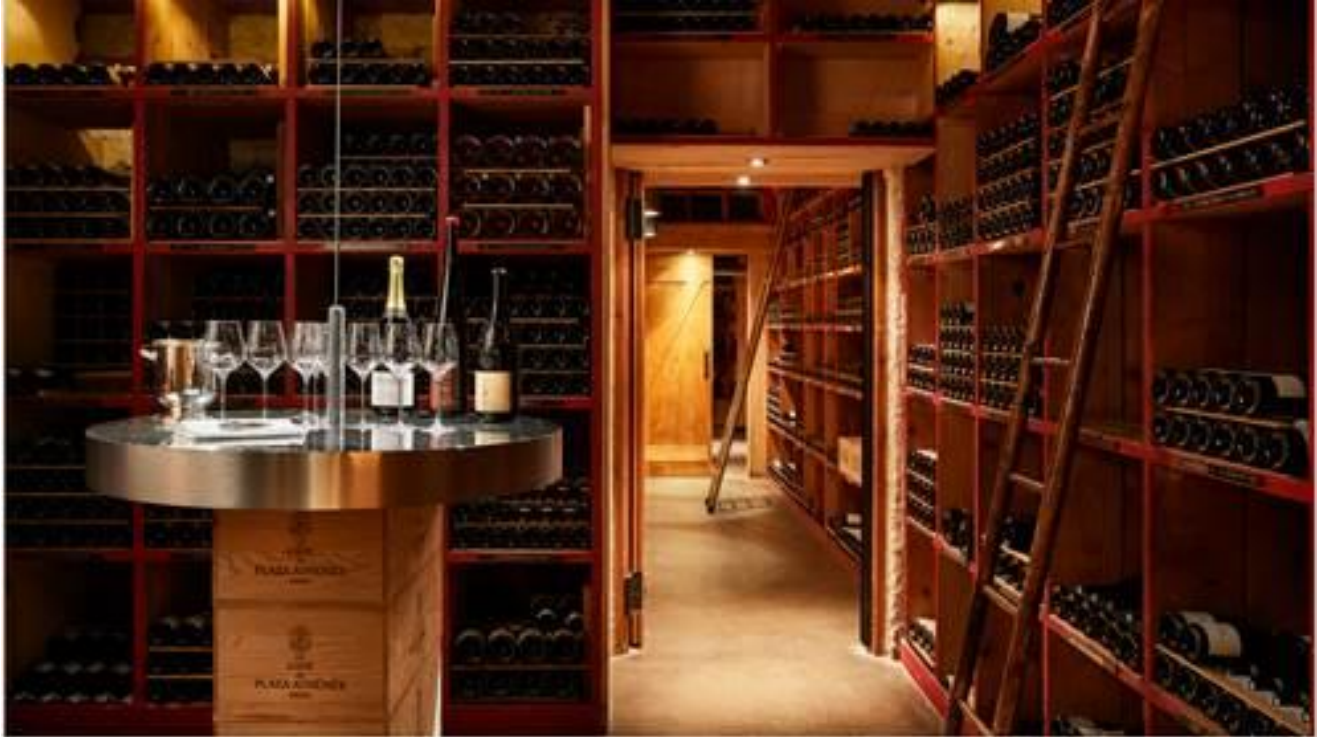
The Cellar

Upon request a private visit can be arranged which reveals the secret of the cellar : an impressive selection of 35,000 wine bottles, which include Château Cheval Blanc, Château Latour, Château Margaux Pétrus and Montrachet. Delicate finger food can be served during the tastings.