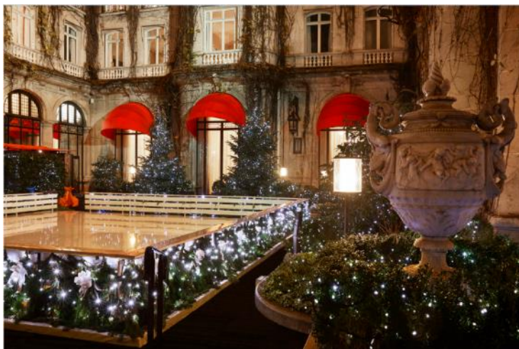
The Ice Rink

OPENING TIMES: In summer season, every day from 12.00pm to 2.30pm and 7pm to 10.30pm