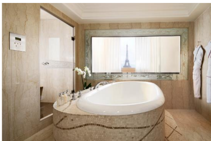
Suite Eiffel Signature