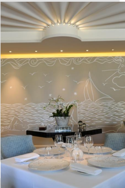
Gastronomic Restaurant Le Cap, with a fresco realized by Michèle Letang

Most furniture, like bedside lamps, was specially designed for the hotel and modernized to match older elements.