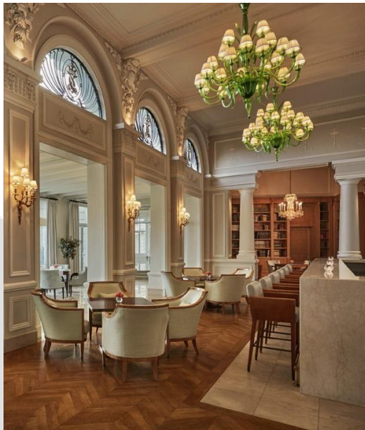
Le Bar with its Murano chandelier