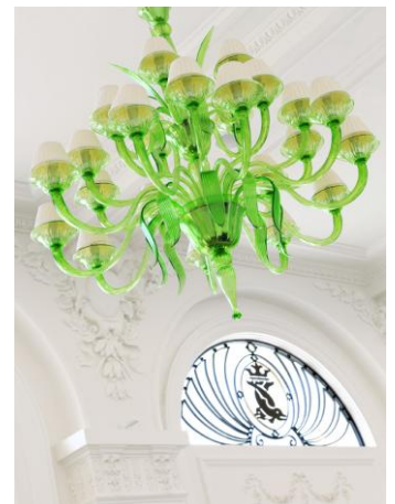
Murano glass chandelier, at La Véranda