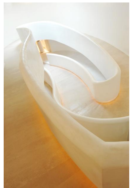
Access ramp to Le Spa made of beige natural stone and white stucco