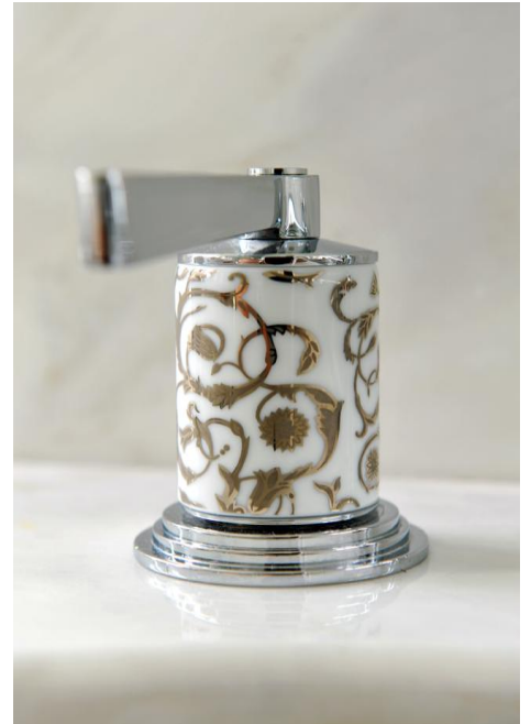
Plumbing made especially for the Grand-Hôtel