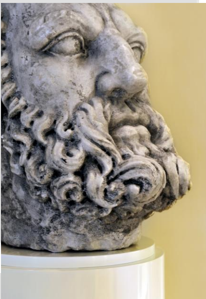
Sculpture in white marble Paros from l'Atelier Prométhée