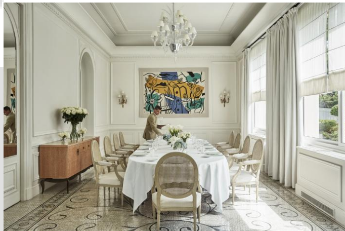
A tapestry of Fernand Léger, Salon Les Pins