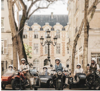
Sidecar tours in Montmartre. SACREBLEU PARIS

I often try local travel companies when I'm in Paris who arrange guided tours of museums and other excursions, but on my most recent trip in the fall, I had the pleasure of using the best one yet: Sacrebieu Paris .