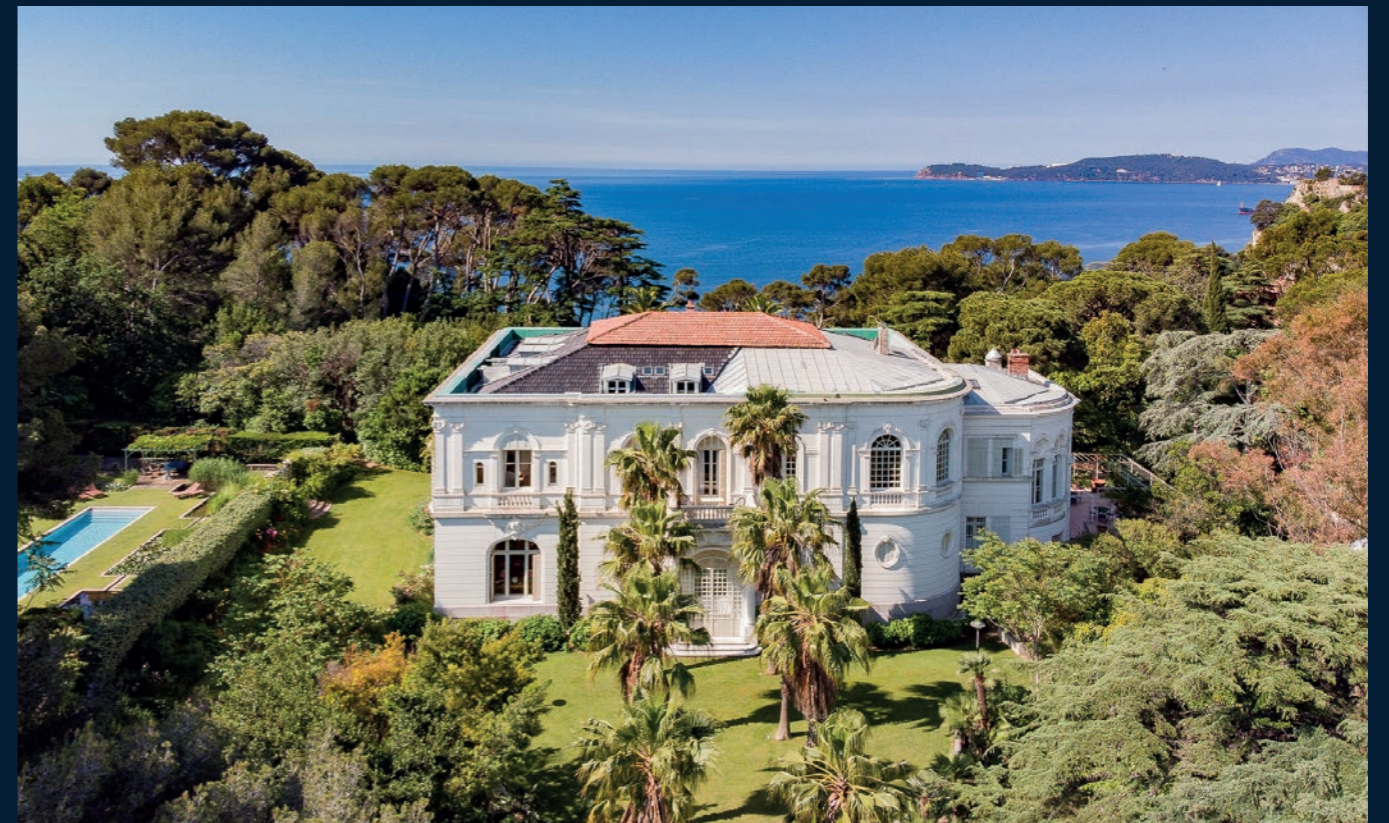
Homanie Côte d'Azur

Homanie sets the bar deliberately high, and is committed to providing an exclusive collection of private residences. Homanie exclusively selects dream houses with incredible views, located in exceptional locations in the South of France, in the Alps, in the Ile de France region or in Spain, Italy or Portugal. Their owners wish to protect the beautiful fragility of these timeless places and reserve them for a privileged few.