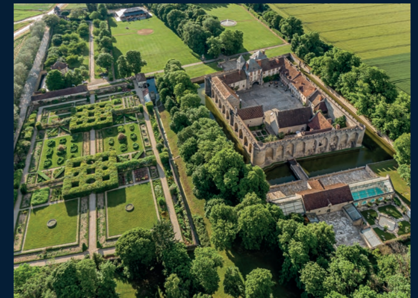
Homanie Ile de France