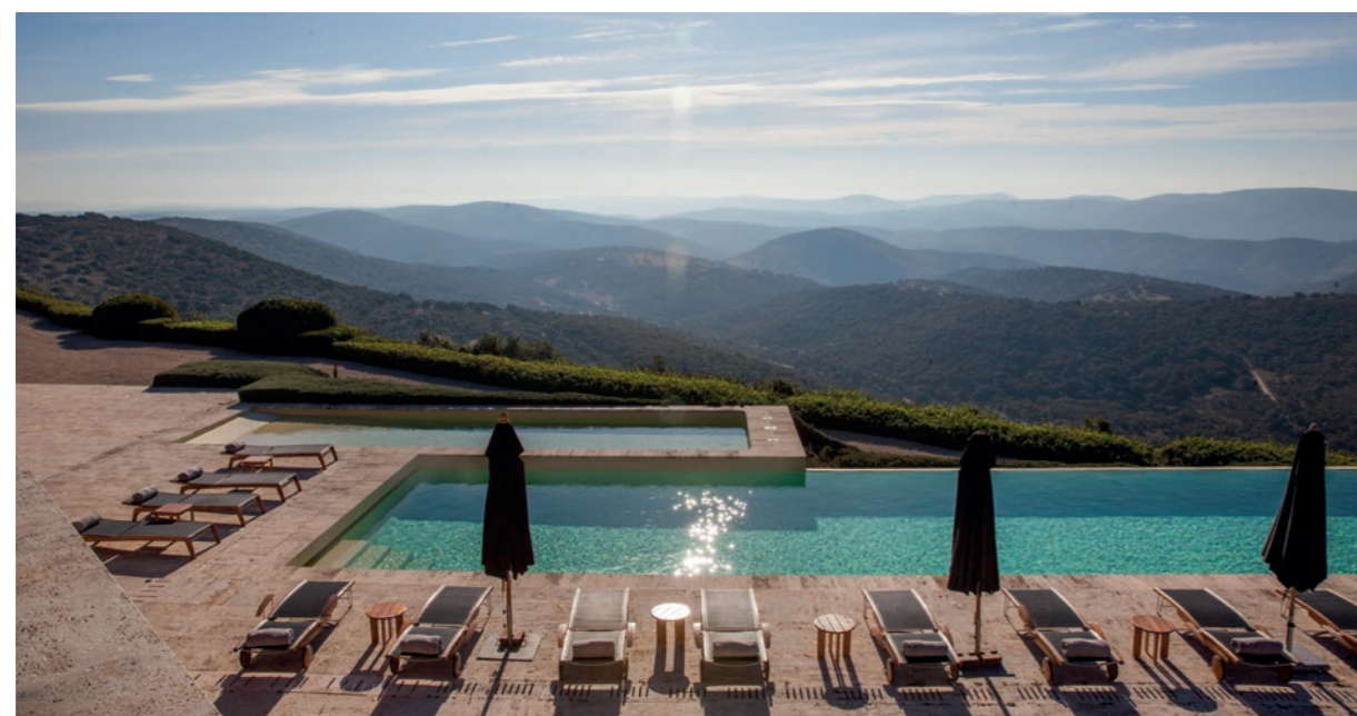
Homanie Castille (Espagne)