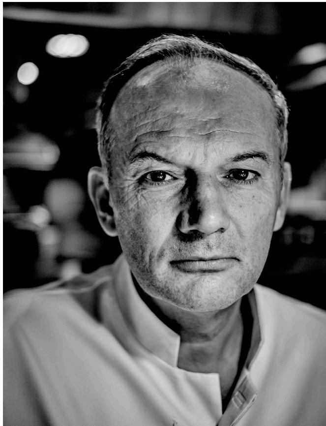
CHRISTIAN LE SQUER

MICHELIN-STARRED CHEF AT LE CINQ RESTAURANT