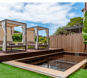
The Zen space.