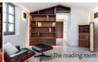
The reading room