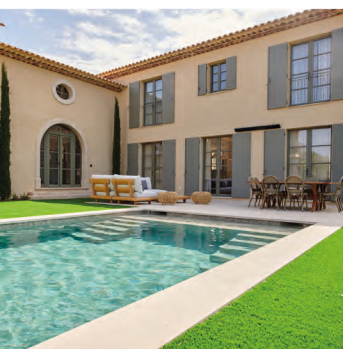
The heated swimming pool

Stunning bathrooms with corian basins, like in the Villa Cosy, offering a unique standard of comfort, with baths integrated spa and/or beautiful roll-in showers. All of this topped off with Sothys beauty products... ■