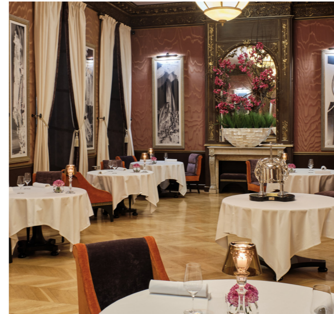
THE PRESOIR D'ARGENT GORDON RAMSAY

Le Pressoir d'Argent with famous British chef Gordon Ramsay at the helm. This two-Michelin-starred gastronomic restaurant has a seductive atmosphere and a creative, tasty cuisine. With its deep respect for authentic produce, Le Pressoir d'Argent Gordon Ramsay offers a menu that pays homage to regional products. Black truffles from the Gironde, foie gras from the Charente or the unmissable Breton lobster à la presse are all references to the richness of France's culinary heritage.